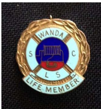
Life Member Badge