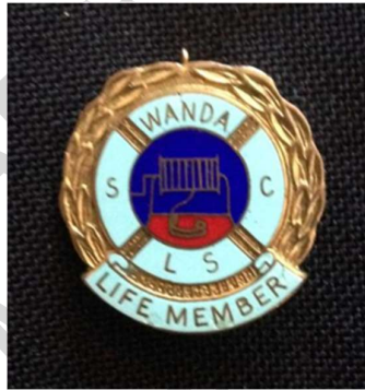
Life Member Badge