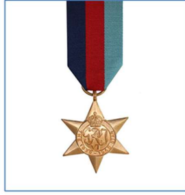
1939-45 Military Star